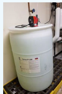
NSF SCALE & CORROSION INHIBITORS