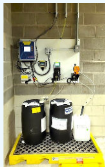
NSF CHLORINE DIOXIDE SOLUTION